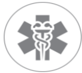
Health & Dental