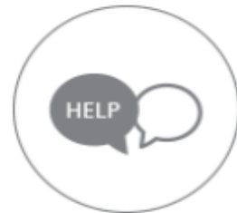
Suicide Prevention & Loss