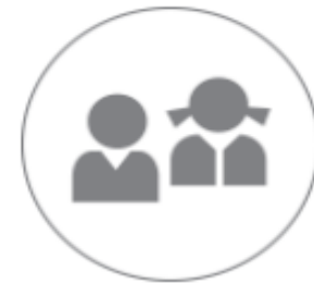
Children & Youth