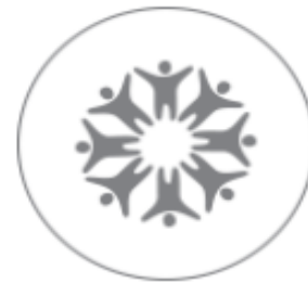
Community & Connection